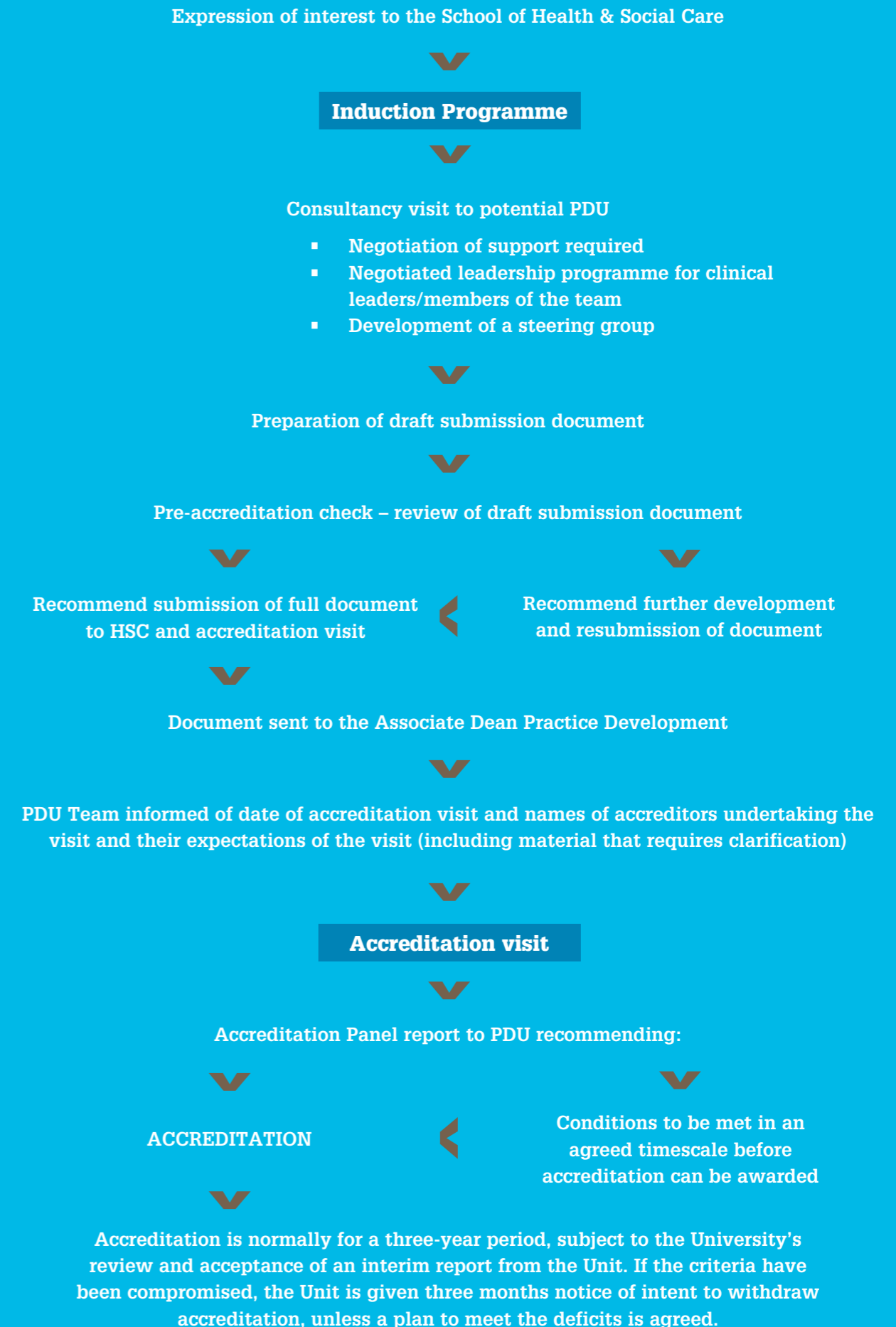
Diagram of the two year Accreditation Process