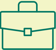
Non- Governmental Organisations (NGOs) and Public Service

Works with offenders to reduce reoffending and help them reintegrate into society while ensuring they comply with court orders.