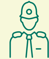
Law Enforcement & Public Safety

A lawyer employed within a company to provide legal advice on contracts, compliance, and risk management.