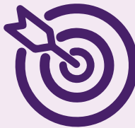
Marketing and Distribution

Festival Programmer Selects the films to be shown in festivals, cinemas and on TV. They work with sales agents and distributors and make deals to the rights of productions they are interested in buying. Marketing Manager Help to identify the key audiences and create campaigns to bring productions to their awareness. Publicist Responsible for generating coverage of a production through having valuable relationships with journalists and critics, creating a 'buzz' surrounding its release. Sales Agent Works with the interest of the producer to close sales on the production rights, usually at film festivals and markets aiming to obtain funds for production. Distribution Executive They work to bring a production to the audience's screens, from streaming to cinemas by negotiating for the rights, once secured they manage its publication. Studio Executive They determine which films are produced and have responsibility for funding, marketing and advertising. Often they meet with sales agents to hear their pitches.