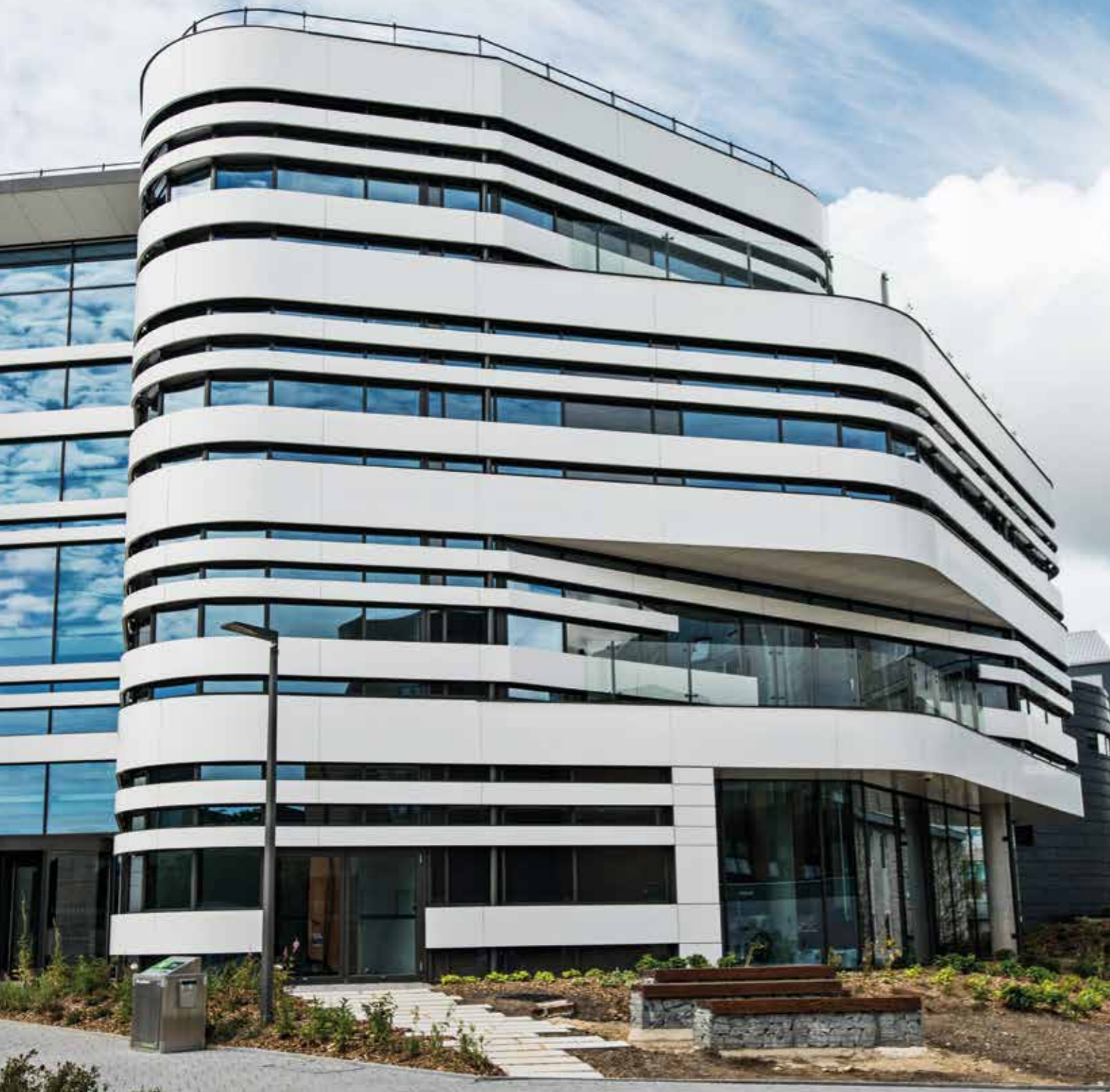
The Fusion Building, Talbot Campus