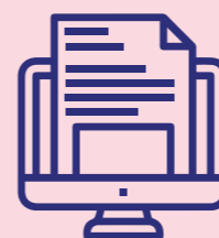
Computer- Generated (CG) Department

Brings together all the elements from pre-production to provide a visual representation of the narrative.