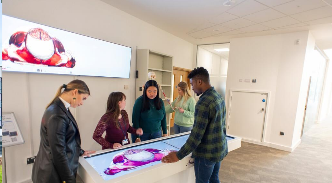
Lansdowne Campus: Bournemouth Gateway