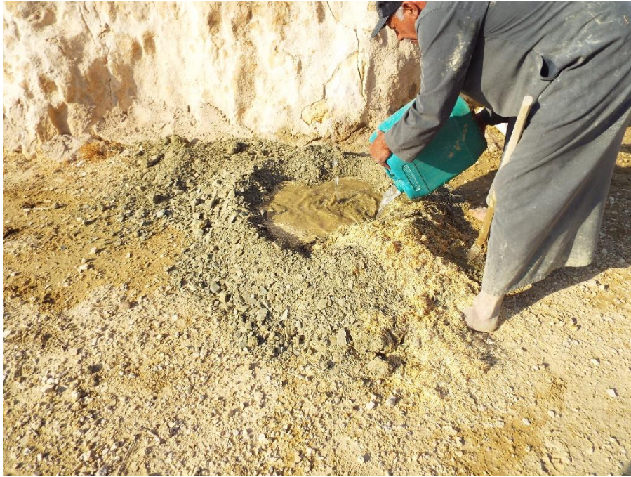
Traditional method of producing roof plaster using green clay (samaga), temper (tibn) and water at the village of Ma'tan, near Tafila, Jordan.