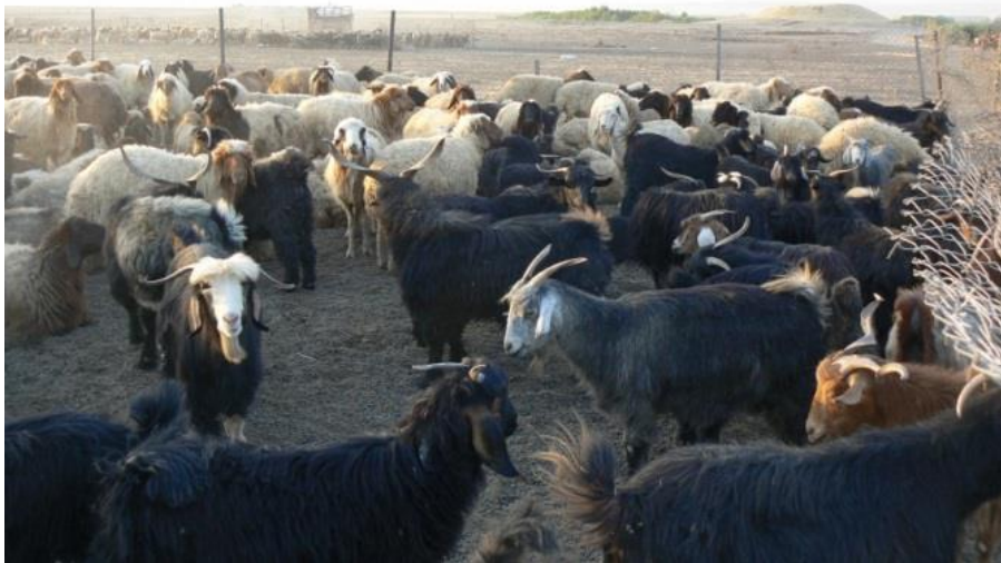
Sheep and goat herds penned in temporary animal pens in the fallow fields during the summer in Bestansur, Iraqi Kurdistan