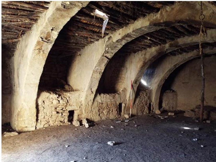
'Building 1' at Ma'tan. Ma'tan is an abandoned traditionally built village near Tafila, Jordan

Increasingly an ethnographic approach, investigating patterns from modern samples, is being taken to compare against ancient deposits and to address each of the topics above. Human and animal activities on archaeological sites are regularly studied in detail; however, the application of ethnographic datasets is increasingly becoming important. It is also valuable to document modern communities and traditions especially with the growth of interest in combined methodologies. Near Eastern sites are key in the early establishment of settled villages and the development of domestication and farming. New research in this area is crucial to our understanding of the past.