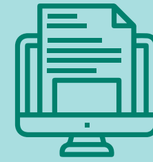
Computer-generated (CG) department

Discover more about our degrees at www.bournemouth.ac.uk/ug-cave