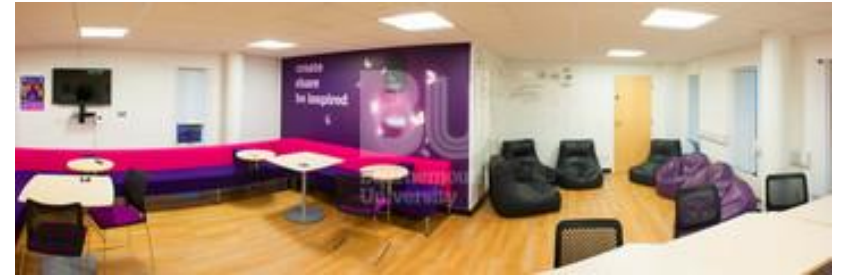
E-learning resources and group work areas