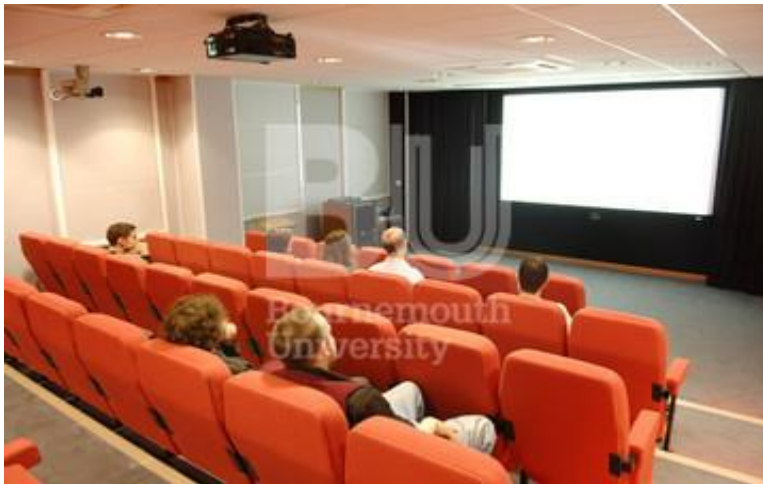
60 seat screening room