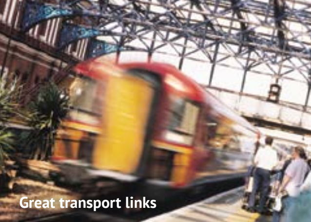
Great transport links