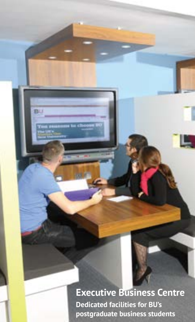
Executive Business Centre Dedicated facilities for BU's postgraduate business students