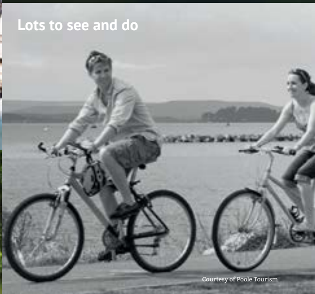
Lots to see and do