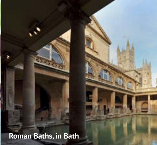
Roman Baths, in Bath