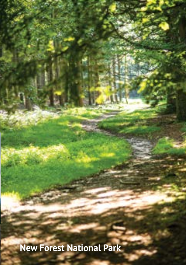
New Forest National Park