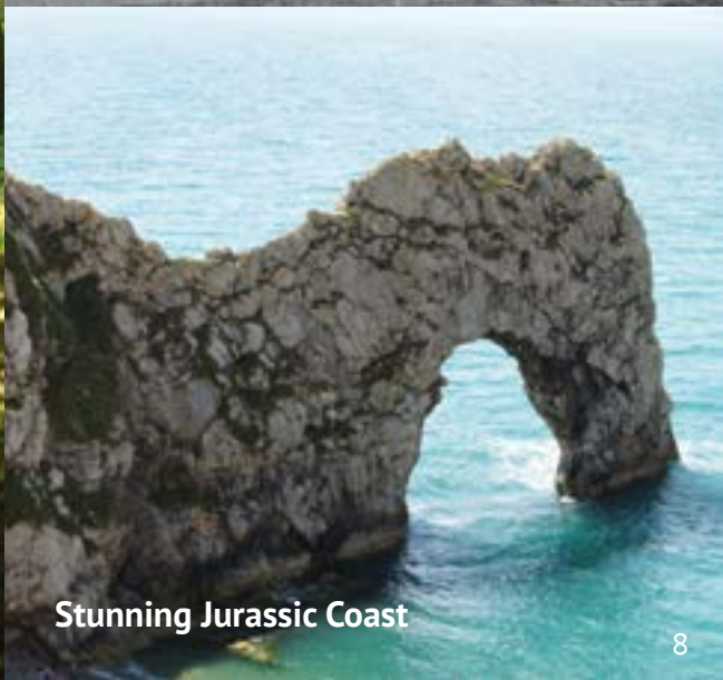
Stunning Jurassic Coast