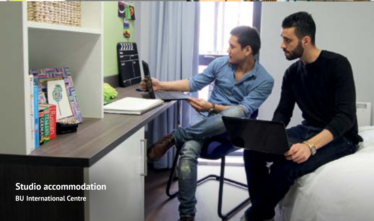
Studio accommodation BU International Centre