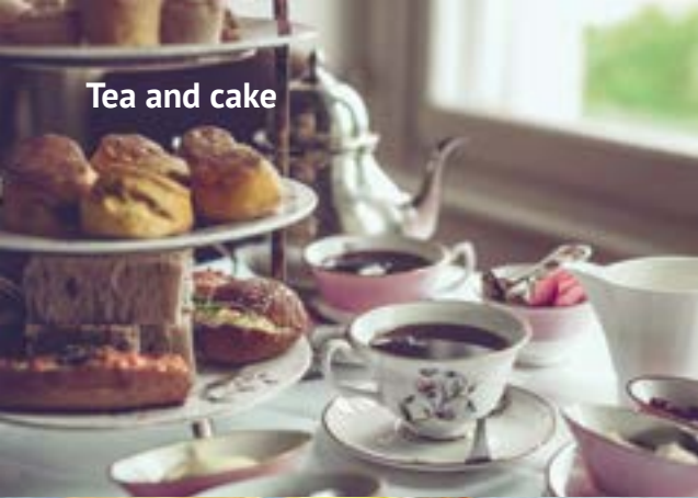
Tea and cake