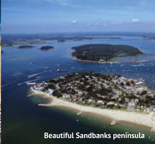
Beautiful Sandbanks peninsula