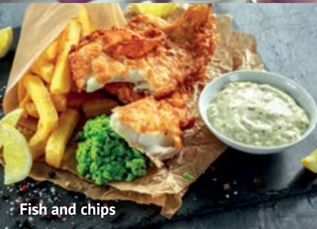
Fish and chips