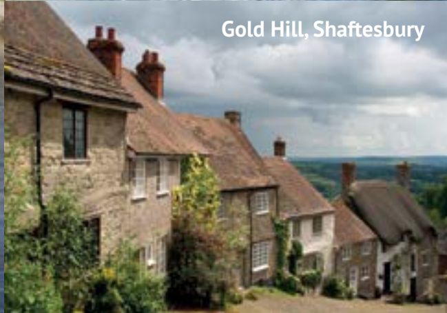
Gold Hill, Shaftesbury