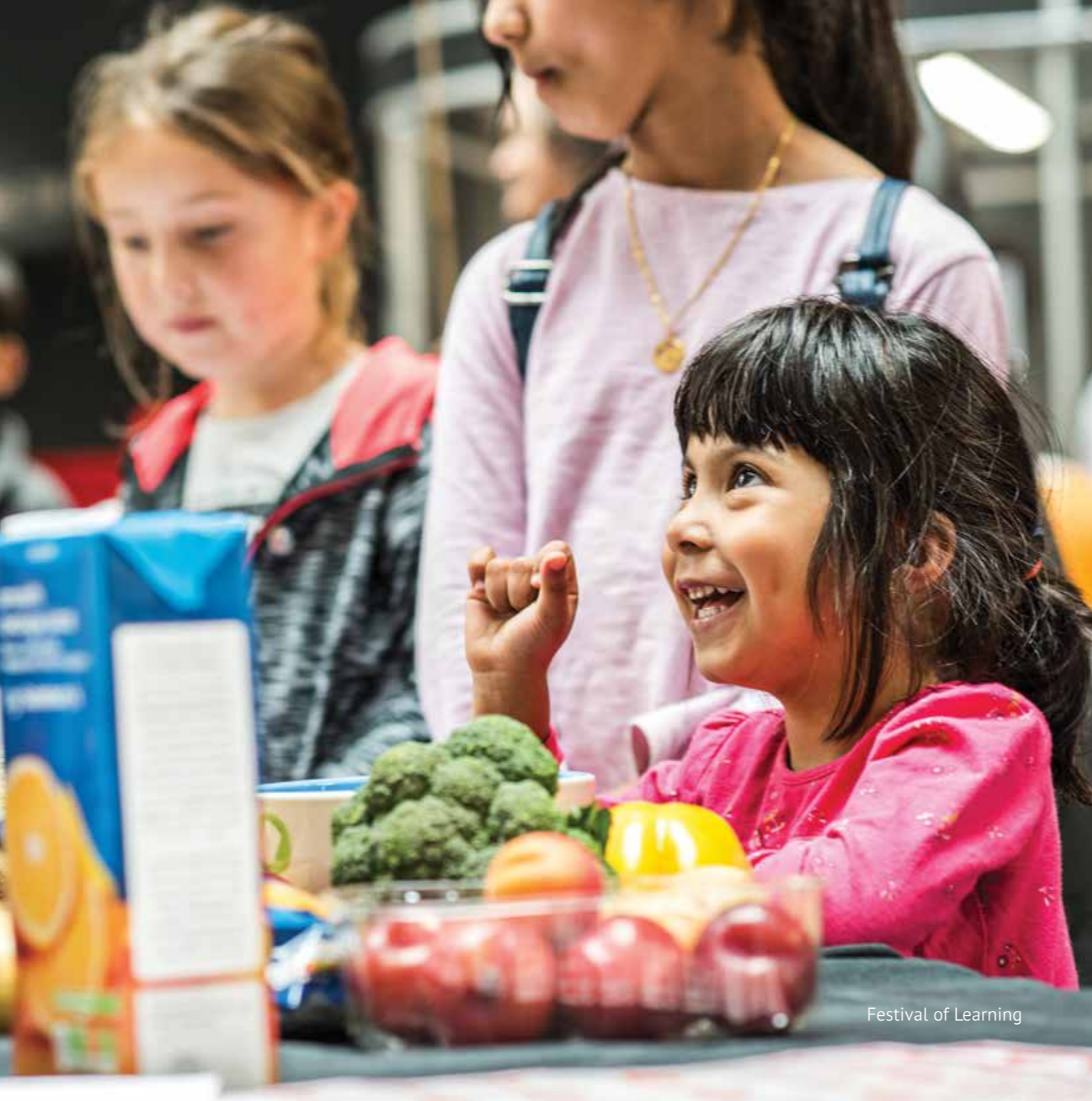
Festival of Learning