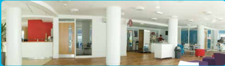
Studland House Café