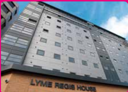
Lyme Regis House

This building houses 400 students, consisting of 10 self-contained studios and 390 rooms in five-bedroom cluster flats.