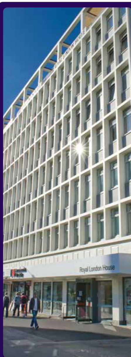
askBU Enquiry Service