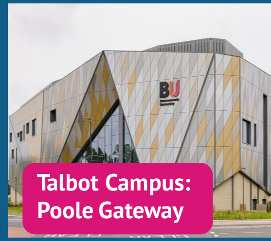
Talbot Campus: Poole Gateway