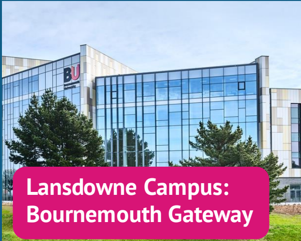
Lansdowne Campus: Bournemouth Gateway

See it for yourself Visit our Virtual Tour to see everything in 360° www.bmth.ac.uk/virtual-tour